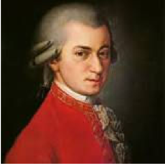
Wolfgang Amadeus Mozart